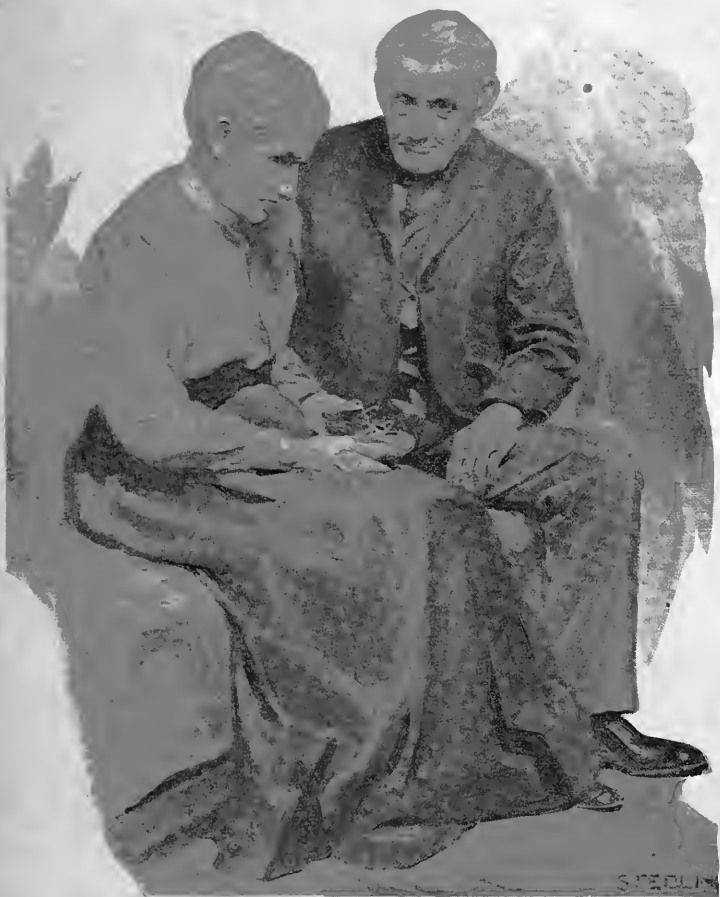
The Lonesome Time o' Night